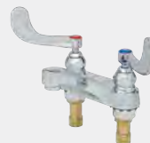
B-0890-VF05 3 3 / 4 " cast basin spout with 0.5 GPM VR non-aerated spray device