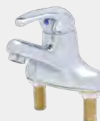
B-2701 Single hole, single lever with 2.2 GPM aerator