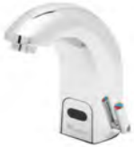
EC-3142-VF05 deck-mount cast spout