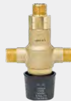
EC-TMV 1/2" NPSM male threads