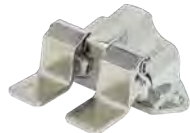
B-0502 Double pedal valve, floor-mount