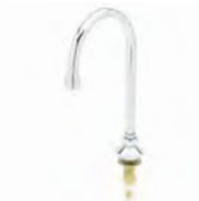
B-0520-F05 6" rigid/swivel gooseneck