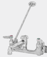
B-0665-POL Built-in stops, 8" centers, vacuum breaker nozzle, polished chrome