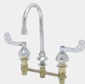
B-2866-05 Concealed widespread faucet w/ 2.2 GPM Aerator, swivel gooseneck