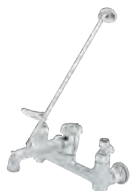
B-0665-BSTR Built-in stops, 8" centers and vacuum breaker nozzle, rough chrome