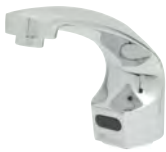
EC-3102 deck-mount cast spout