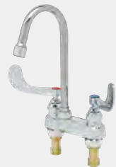
B-0892-01 4" lavatory faucet w/rigid gooseneck, 2.2 GPM Aerator