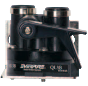
Everpure's replaceable filter cartridge (B-WFC, left) and the docking station (B-WFDS, above)